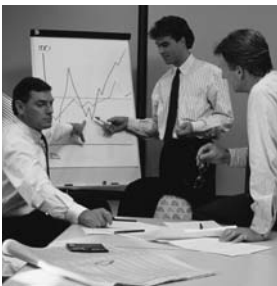
Jesse White Illinois Secretary of State